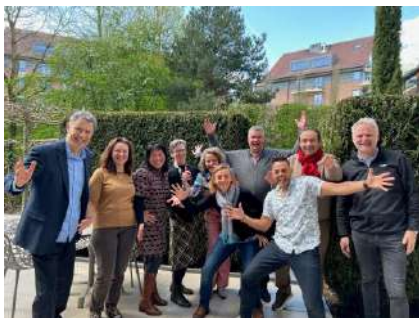
LCAC group Waterloo 2023

Waterloo (south of Brussels), Belgium 23-25 April 2024