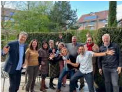
LCAC group Waterloo 2023

Waterloo (south of Brussels), Belgium 23-25 April 2024